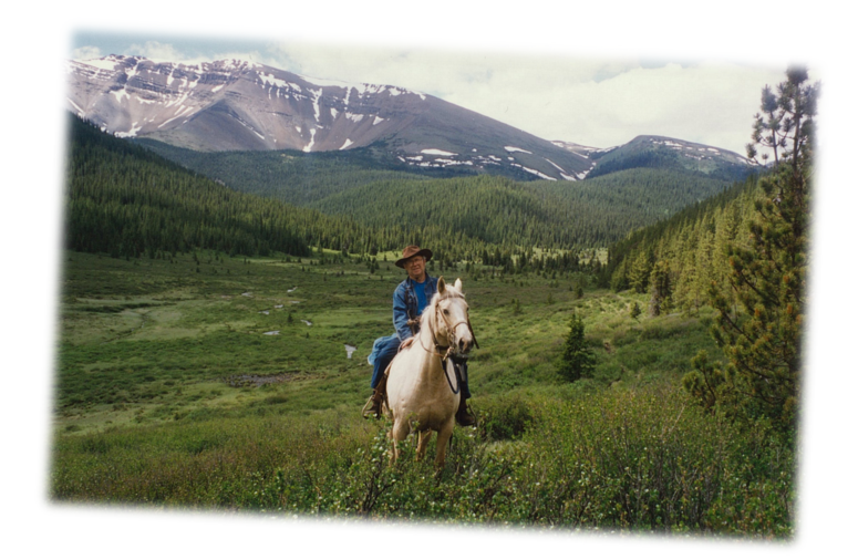
Oh, if they could talk, It would be just the start Of a story of love, A great man and his heart.